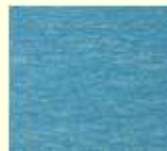
CTPHRT "HEAT TILE"