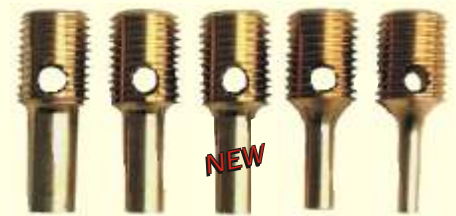
RT250 RT205 RT190 RT150 RT110 "CUSTOM SIZES AVAILABLE"