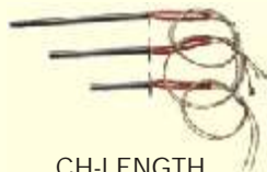
CH-LENGTH "REPLACEMENT HEATERS"